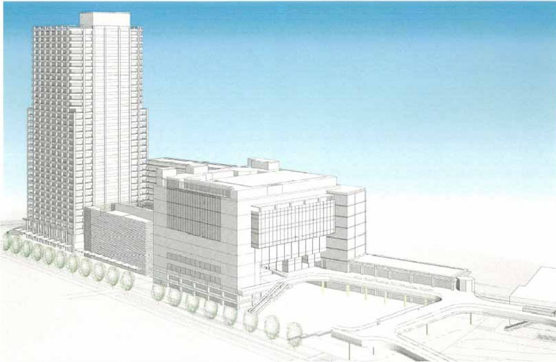
Image of the Cupo·la Main Building (1-1 Kawaguchi Redevelopment Project)